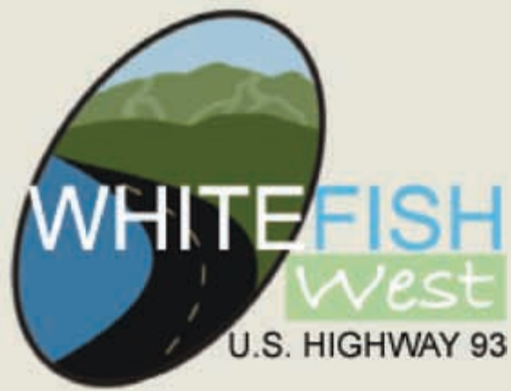
FIGURE 1: US 93 WHITEFISH WEST PROJECT LOCATION AND MILEPOST LIMITS