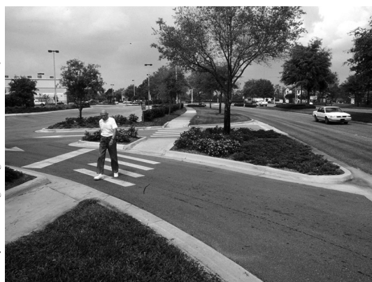
Multimodal streets like this one improve access and safety for drivers, pedestrians and cyclists.

Transit-Oriented Development. Complete streets policies go hand in hand with transit-oriented development (TOD). Traffic-calming measures, streetscape improvements, and transit have successfully been combined to revitalize entire commercial districts. Both residential and commercial projects near transit typically appreciate in value more rapidly than other projects. In a TOD land uses and infrastructure are arranged to encourage and to facilitate the use of transit while accommodating a range of travel modes and purposes. Transition points where travelers transfer easily from one mode of transportation to another are key features of both complete streets and TODs.