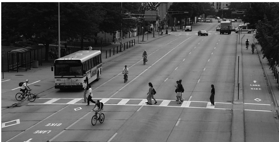
Multimodal streets like this one improve access and safety for drivers, pedestrians and cyclists.

Vulnerable Populations. Truly complete streets go beyond accommodating bicycling and walking to consider children, the elderly, and people with a disability. More often than not, the elderly and people with disabilities rely on the pedestrian and transit infrastructure for access and mobility. Complete streets policies make it possible for vulnerable populations to better use transportation systems by equipping streets with the necessary infrastructure, including curb ramps, textured and varied pavement, audible crossing signals, countdown signals, and high-visibility crosswalks.